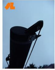
Soldered Mast hound