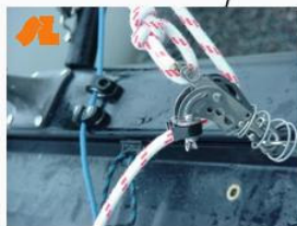
Wichard fittings for the jib