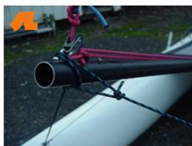
Aluminium Spinnaker pole, easy of handling for parking.