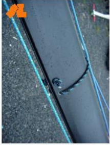
Wichard Blocks and Dyneema