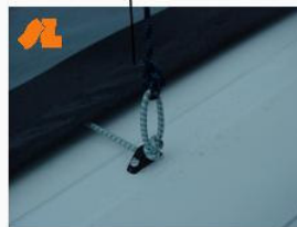
Open base fairlead for trapeze

Polyester rudder blade, a 180° rudder blade system